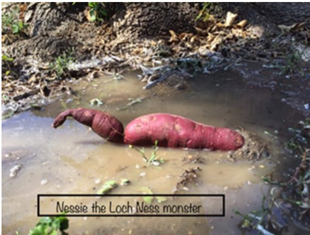
DENTON CREEK ES NESSIE - JULIA