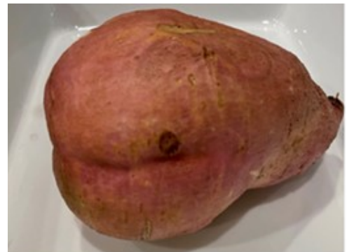
WHALE - TANVI