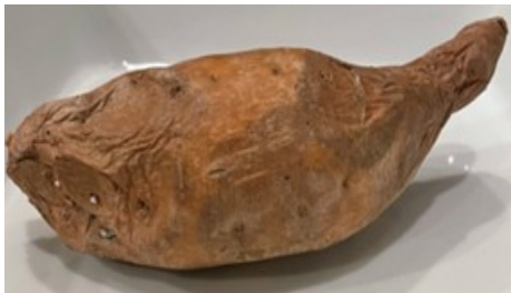
CHS ECO CLUB