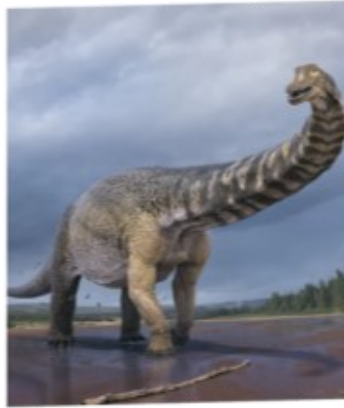
CANYON RANCH ES DINOSAUR - REAGON