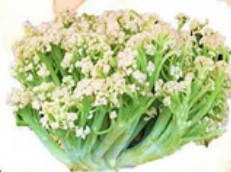
Cauliflower is edible flowers

Cauliflower is loaded with Beta-Keratene, Kaempferol, Quercetin, Rutin, Cinnamic Acid, Indole-3-Carbonol What do all those words mean?