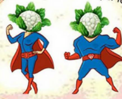
Cauliflower is considered a "super food"!

The words mean that Cauliflower is Rich in Fiber, High in Brain Boosters, Rich in Vitamin C, Low in Calories Cauliflower can Purify Blood, Fight Cancer, Help your Heart and Kidneys, Support Digestion