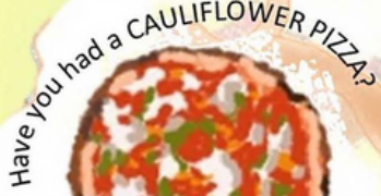
Have you had a CAULIFLOWER PIZZA? The cauliflower isn't on top. The Crust is cauliflower!

Cauliflower is loaded with Beta-Keratene, Kaempferol, Quercetin, Rutin, Cinnamic Acid, Indole-3-Carbonol What do all those words mean?