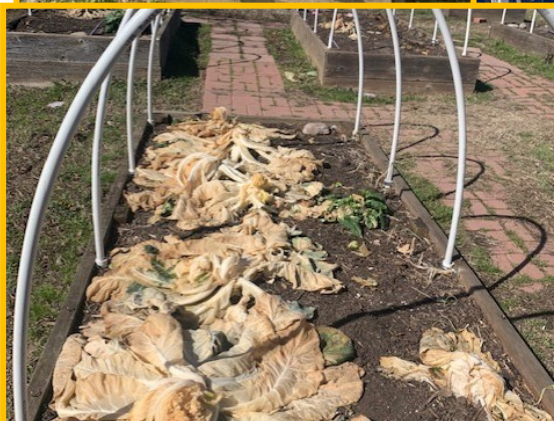
DENTON CREEK ELEMENTARY before, after & ready to start again